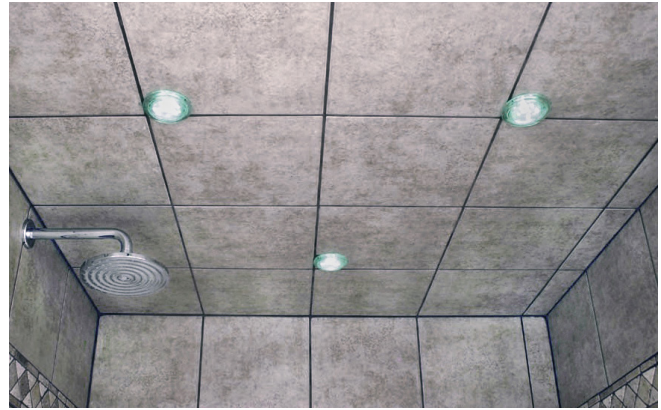
Chromatherapy White Light Kit