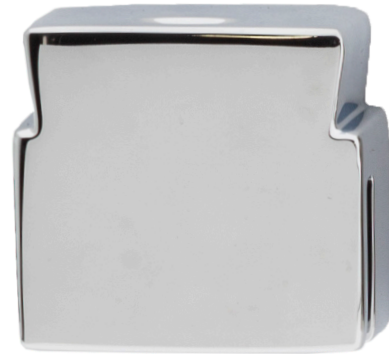
ComfortFlo Steam Head